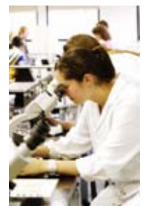
Veterinary science needs more graduates to enter research

Students who achieve an average mark greater than 70 throughout the course but elect not to complete a research project will graduate with Merit.