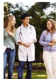
A mentor program will help interns and new graduates

If you are interested in being a mentor to one of our interns in the future we will be offering training in 2008.